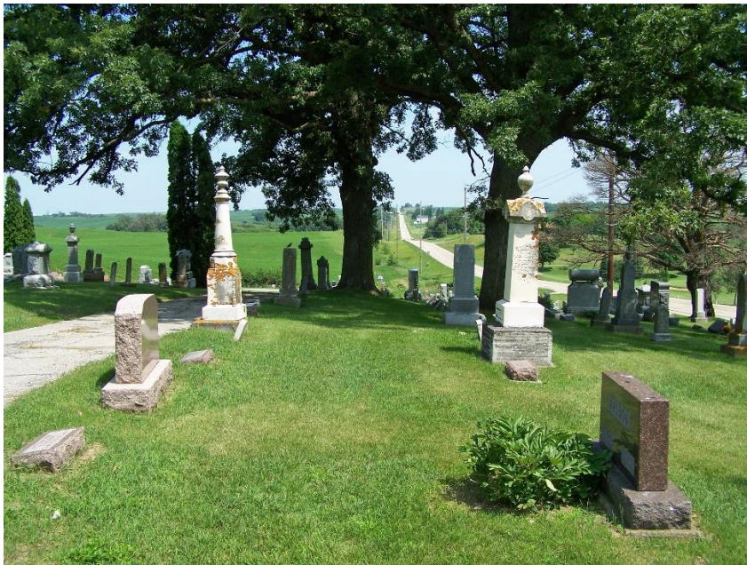
The Watson family plot, Wyoming Cemetery